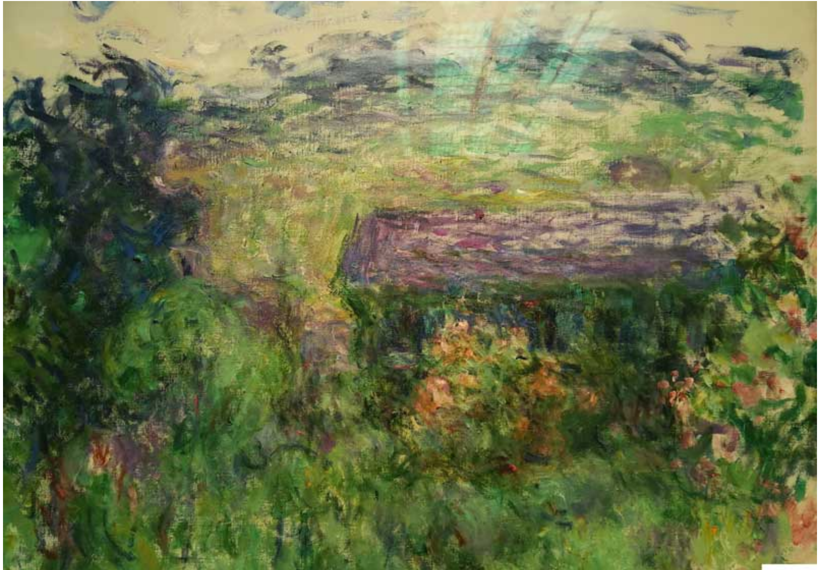
Claude Monet at the Singer Karen Museum

With a fine selection of garden paintings by Dutch, Belgian, and French painters from around the 1900s, this exhibition celebrates the reopening of the Singer Sculpture garden.